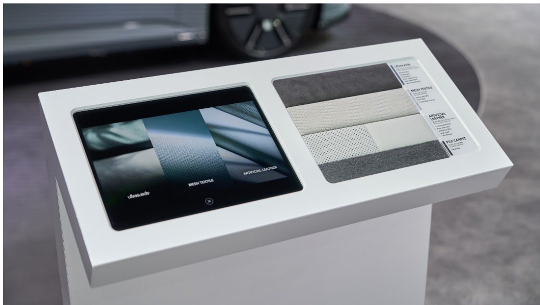
A kiosk of high-quality functional materials used in the interior of AFEELA 1

For details, please see the following press releases and press conferences announced by Sony Honda Mobility at CES® 2025. For media assets, please download from the media resources.