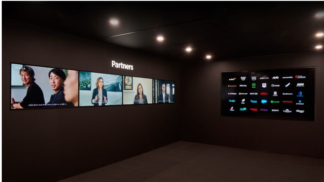
Showcasing SHM's partner companies collaborating in the development of AFEELA