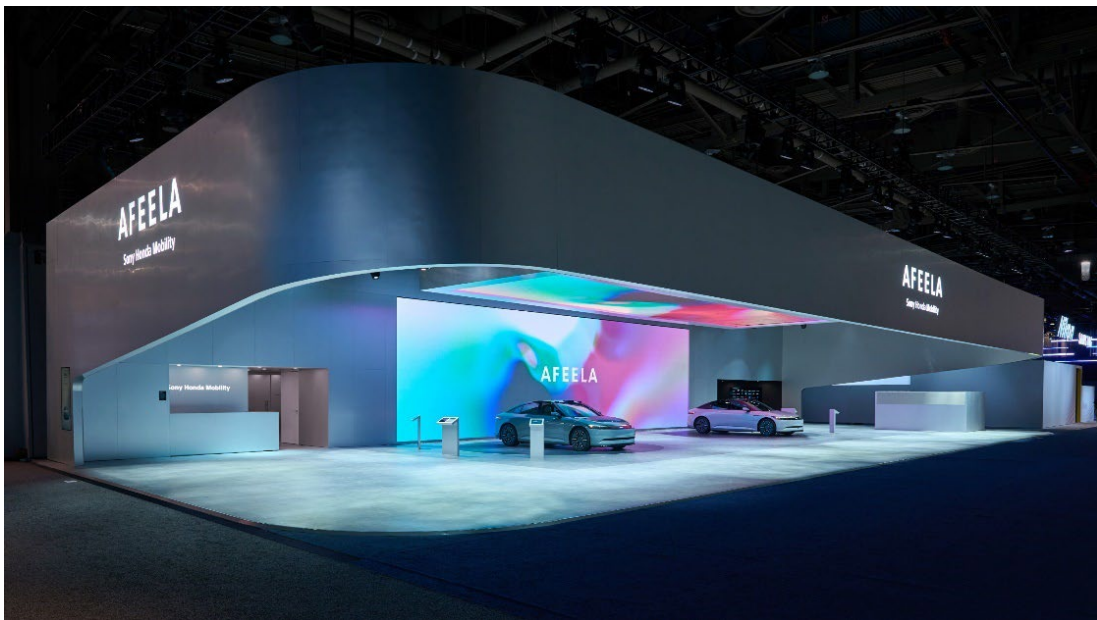
Sony Honda Mobility's booth at CES® 2025

During the public exhibition period of CES® 2025, the booth showcases and introduces the AFEELA 1 Signature to visitors. SHM also showcases its partner companies collaborating in the development of AFEELA, as well as kiosk of high-quality functional materials used in the interior of AFEELA 1, presenting SHM's vision for the future of mobility.